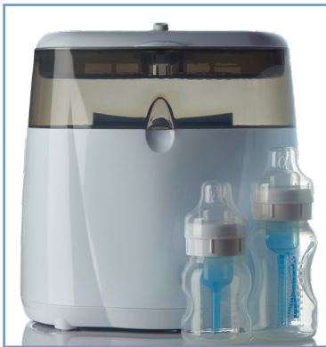
Electric steam steriliser