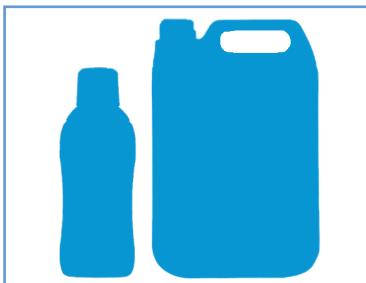
Cold water steriliser