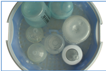
Microwave steam steriliser